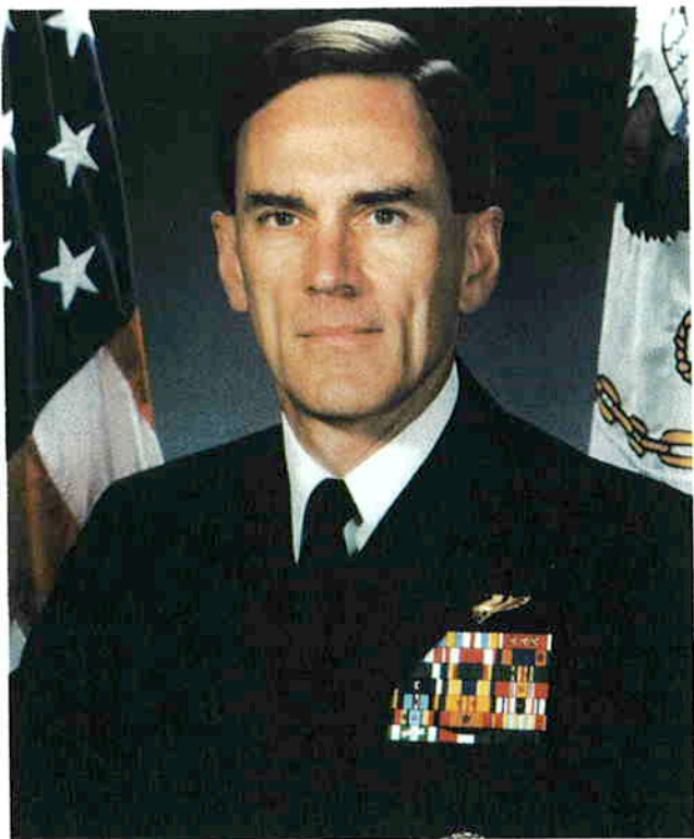
Admiral Jay L. Johnson Chief of Naval Operations