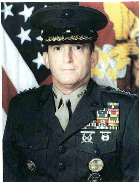
General C. C. Krulak Commandant of the Marine Corps