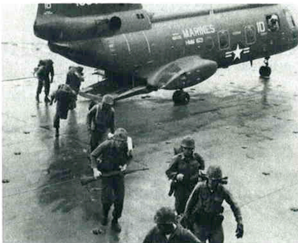
Marines returning from Vietnam, circa 1969.