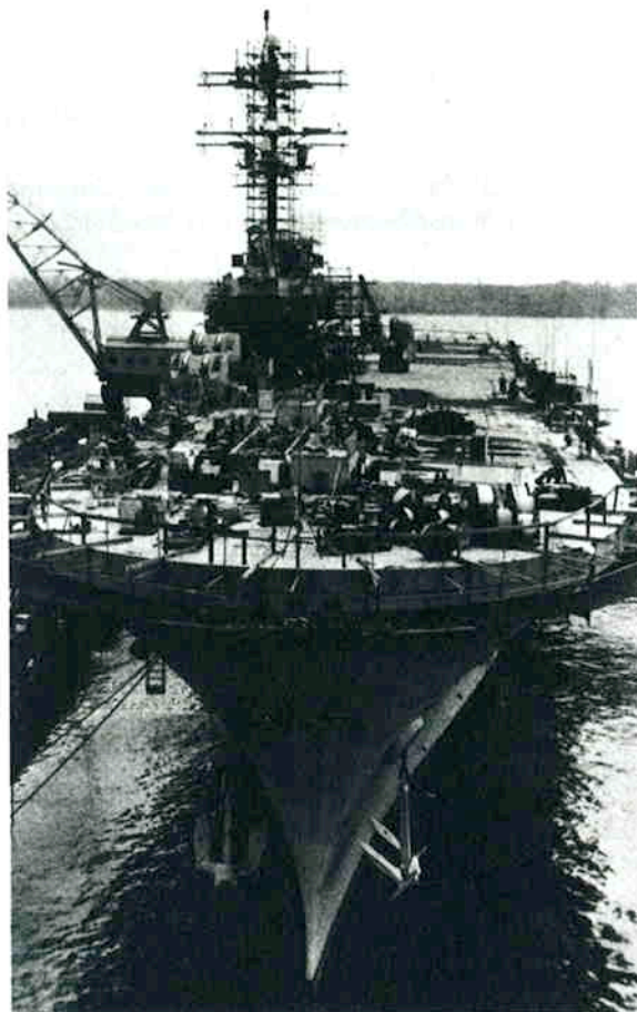
USS NEW ORLEANS (LPH 11) under construction at the Philadelphia Naval Shipyard, 1968.