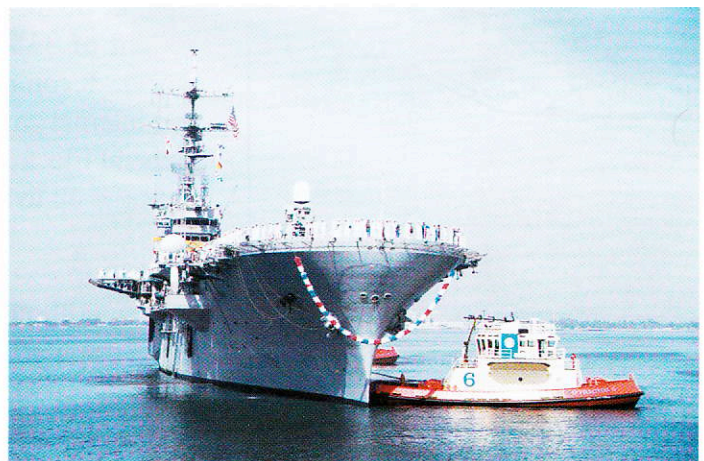
NEW ORLEANS returned from her final deployment on May 2, 1997.