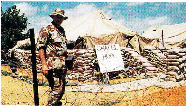
Finding hope in Somalia's barren landscape.