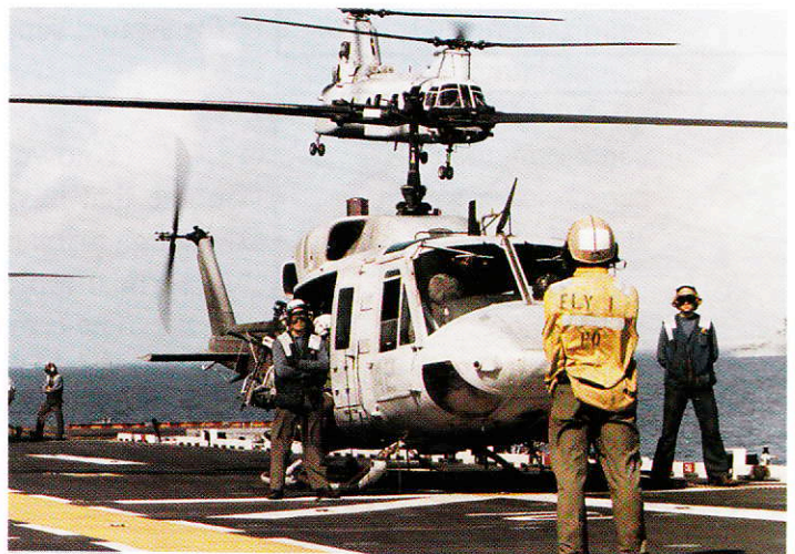
Just another busy day on the flight deck of USS NEW ORLEANS.