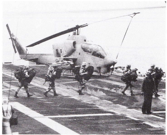
Marines debark NEW ORLEANS during OPERATION DESERT STORM, bound for Kuwait. NEW ORLEANS was the only Navy ship to send troops into combat during the Gulf War.