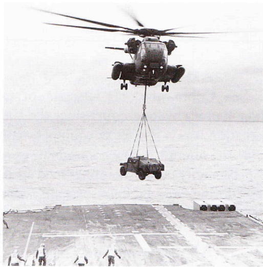
A CH-53 drops off a Marine vehicle during OPERATION DESERT SHIELD.