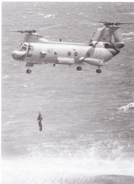
A CH-46 from HC-11 rescues a very lucky Marine who fell overboard.