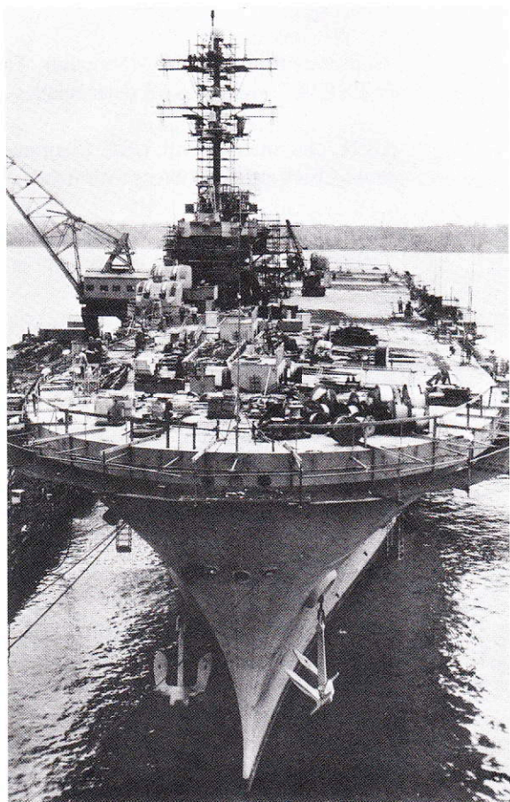
USS NEW ORLEANS (LPH 11) under construction at the Philadelphia Naval Shipyard, 1968.