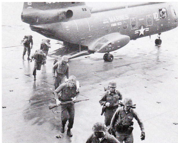
Marines returning from Vietnam, circa 1969.